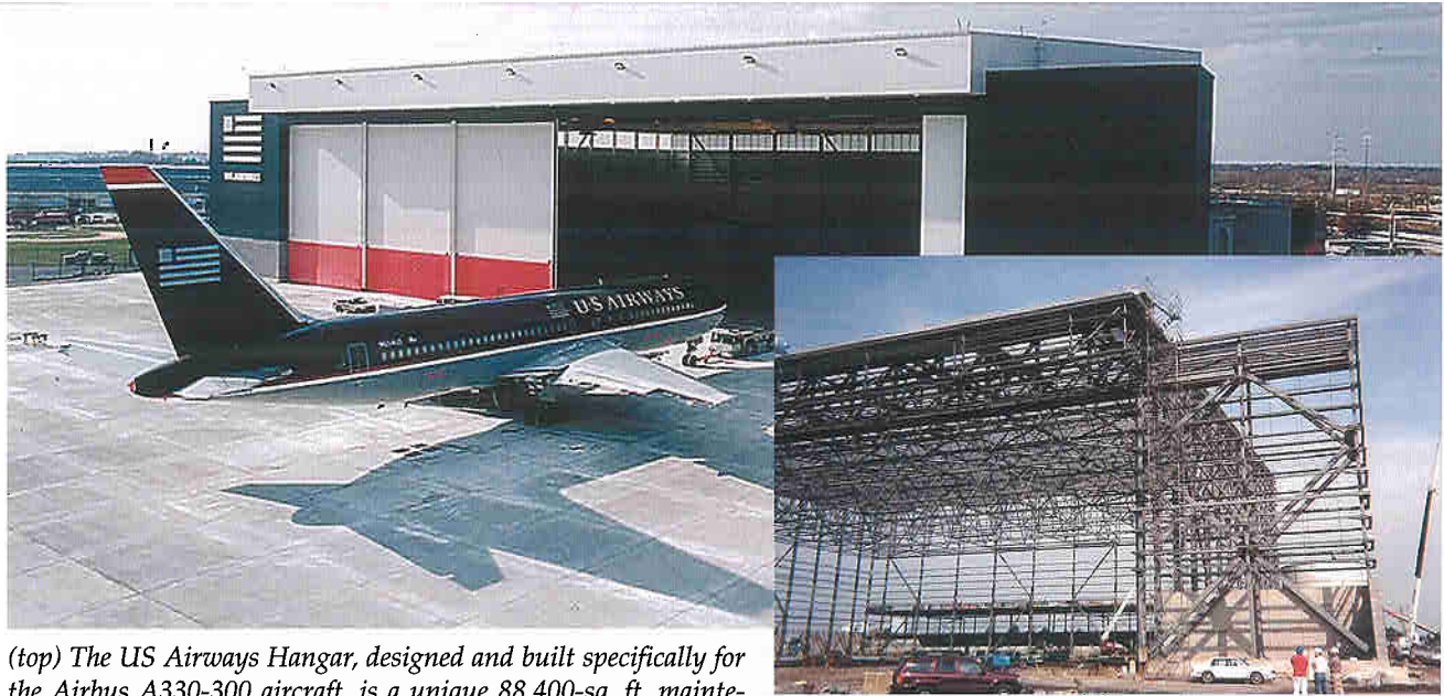
(top) The US Airways Hangar, designed and built specifically for the Airbus A330-300 aircraft, is a unique 88,400-sq. ft. maintenance facility, which is nearly 303' wide and 281' long. At the front of the structure, the roof is nearly 87' above the finished floor and rises to a height exceeding 106' at the back of the building. Over 1,200 tons of steel were used in the structure. (right) The design team chose to use a flat-bottom roof truss scheme that varied the truss depth to create the proper roof pitch.

structure had a unique configuration sloping from the rear of the hangar towards the doors at the front. The design team chose to use a flat-bottom roof truss scheme that varied the truss depth to create the proper roof pitch. Trusses varied in depth from 13½' above the hangar doors to nearly 35' at the rear of the building. This framing system kept the bottom chords of the trusses at the same elevation, simplifying the bracing system and providing easy support for the two 5-ton and one 10-ton underhung cranes. The building also had overhangs at each end of the building, which further complicated the framing system. The unique roof slope created the need for a custom interior gutter, located above the hangar doors. The gutter, which is 2' wide and 8" deep, was fabricated out of stainless steel.