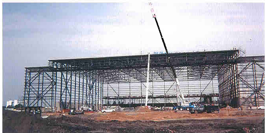
The unique roof slope of the US Airways Hangar meant each of the eight trusses was a different height, ranging from 13½' to 35' deep, with no two being the same.