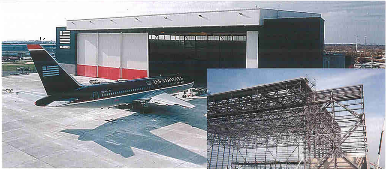
(top) The US Airways Hangar, designed and built specifically for the Airbus A330-300 aircraft, is a unique 88,400-sq. ft. maintenance facility, which is nearly 303' wide and 281' long. At the front of the structure, the roof is nearly 87' above the finished floor and rises to a height exceeding 106' at the back of the building. Over 1,200 tons of steel were used in the structure. (right) The design team chose to use a flat-bottom roof truss scheme that varied the truss depth to create the proper roof pitch.

structure had a unique configuration sloping from the rear of the hangar towards the doors at the front. The design team chose to use a flat-bottom roof truss scheme that varied the truss depth to create the proper roof pitch. Trusses varied in depth from 13½' above the hangar doors to nearly 35' at the rear of the building. This framing system kept the bottom chords of the trusses at the same elevation, simplifying the bracing system and providing easy support for the two 5-ton and one 10-ton underhung cranes. The building also had overhangs at each end of the building, which further complicated the framing system. The unique roof slope created the need for a custom interior gutter, located above the hangar doors. The gutter, which is 2' wide and 8" deep, was fabricated out of stainless steel.